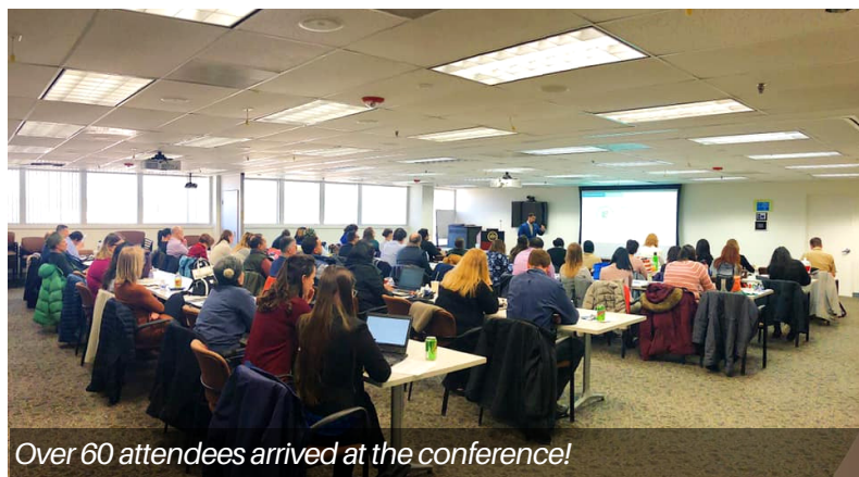
Over 60 attendees arrived at the conference!