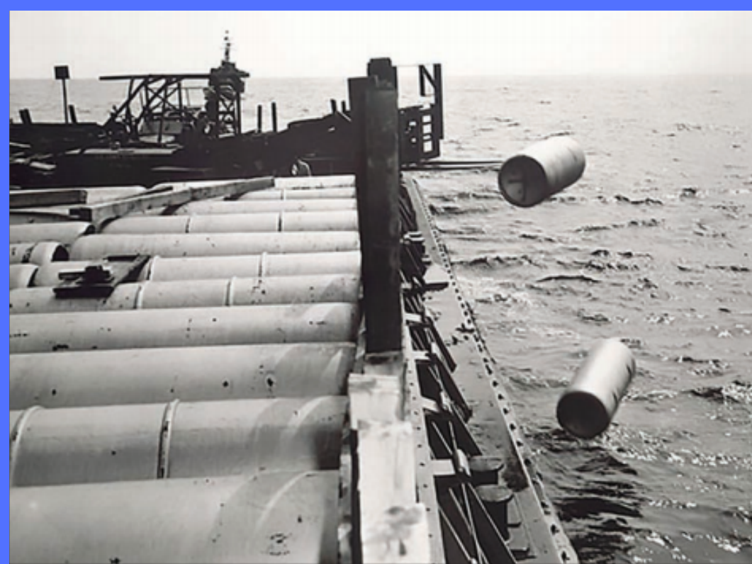
Photo 1. Conducting sea disposal operations.