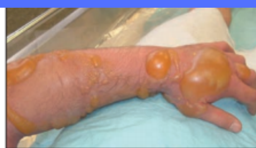
Photo 2. Image of the burns to the hand of an explosive ordnance disposal airman exposed to mustard in 2004.