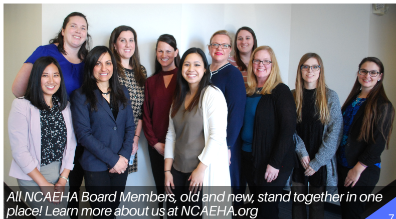
All NCAEHA Board Members, old and new, stand together in one place! Learn more about us at NCAEHA.org